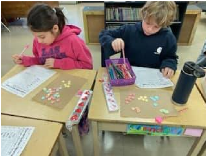
Valentine's Day fun in 3/4!